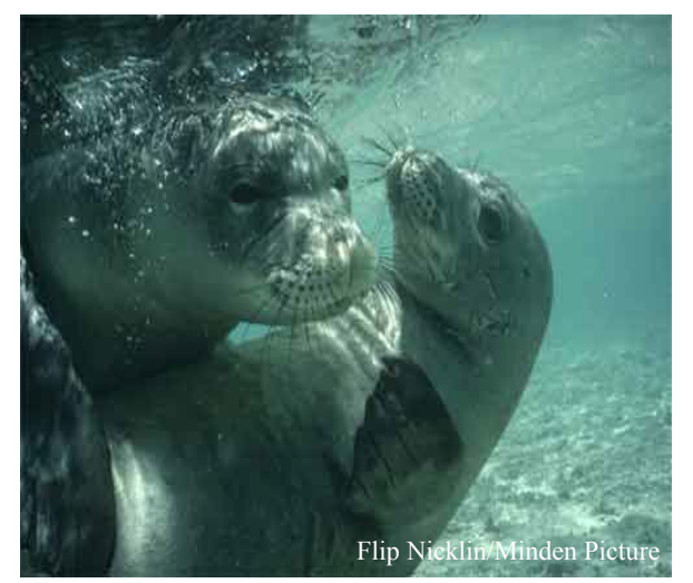
Endangered Hawaiian monk seal and pup