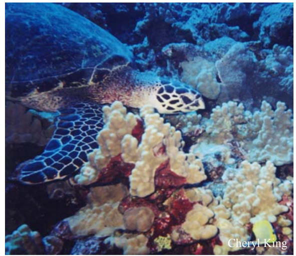
Endangered hawksbill sea turtle