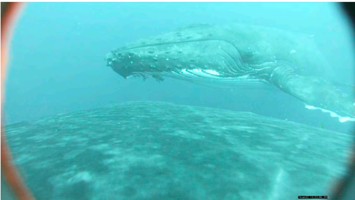
Figure 2 – View from a CATS video tag deployed on a whale in a dyad group showing the companion whale.