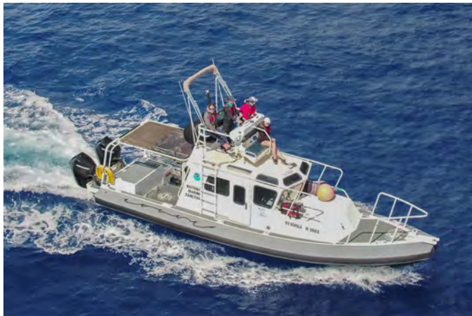
HIHWNMS staff conducting a vessel-based whale survey aboard the R/V Koholā .