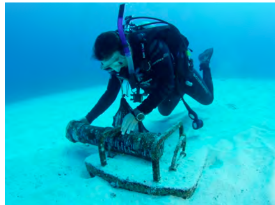
Diver placing an acoustic recorder on the ocean floor.

Background: Between December and April, male humpback whale song becomes the dominant source of underwater ambient noise in many parts of Hawai'i, creating a chorus of whale singing. Because whale song can transmit over several miles, the acoustic energy produced by singing whales can be used to track the relative presence of whales in an area, revealing the timing of their arrival, their peak abundance, and their departure. The abundance of song can also be used to compare the relative occurrence of whales across locations and between years, providing a useful metric for studying geographic variability and annual trends in whale presence. Metrics of whale song abundance are obtained through bottom-moored acoustic recorders that measure the soundscape of an area, which includes whale chorusing, over the course of the breeding season. Automated algorithms are then used to quantify the amount of whale song present in recordings. In addition to monitoring whale song, the recorders are also used to quantify vessel traffic in various parts of sanctuary waters, offering a unique opportunity to examine human use patterns. Acoustic monitoring efforts are led by HIHWNMS in partnership with Oceanwide Science Institute and are funded in part through the