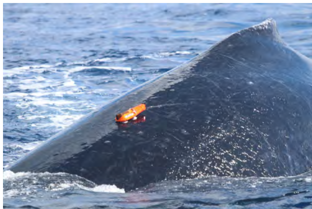
Humpback whale carrying a CATS tag. NOAA permit #19655.