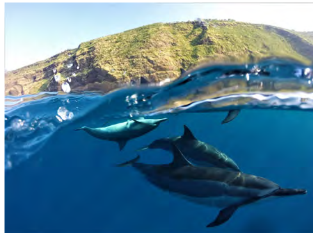
Hawaiian spinner dolphins.

Background: Hawaiian spinner dolphins are resident to Maui Nui waters and occupy the near shore waters off Maui and Lāna'i to socialize and rest during the day. In late 2020, a consortium of organizations began a collaboration to use acoustic monitoring to study and better protect spinner dolphins that use the Honolua Bay (Maui) and Mānele-Hulopo'e (Lāna'i) Marine Life Conservation Districts (MLCDs). This consortium includes The Nature Conservancy, HIHWNMS, State Department of Land and Natural Resources Division of Aquatic Resources, Oceanwide Science Institute, Hawai'i Association for Marine Education and Research, Ultimate Whale Watch and Pūlama Lāna'i. The objective of this effort is to acoustically monitor three known spinner dolphin resting areas in these MLCDs for one year to better understand how dolphins respond to human use changes as the economy of Hawai'i reopens following COVID-related shutdowns.