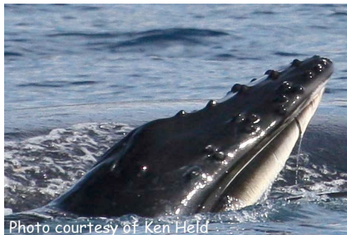
January 2, 2008, calf entangled in monofilament line through mouth

The second confirmed entanglement report involved a humpback calf with monofilament line hanging from its baleen about a quarter of the way back on the right side. The animal was documented by Ken Held aboard the tour vessel, Lanikila, on January 2 off Lahaina, Maui, but was not detected until the photographer took a closer look at his images several days later. Between the assessment of the entanglement being minor and the understandable delay in reporting, no response was mounted on this animal.