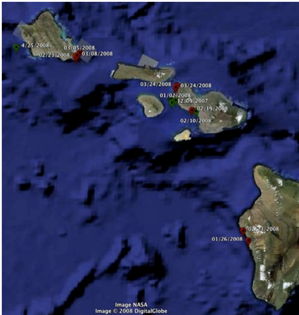
2008 entanglement reports (green = confirmed, red = not confirmed)

Since 2003, the Network has removed approximately 2400 feet of line (does not include netting and twine) from the 9 different humpback whales. Animals have been confirmed entangled in local fishing gear (traps and net), mooring gear, marine debris, and actively fished gear set as far away as Alaska. To date, 6 humpbacks reported entangled in Hawaii have been confirmed to have gear from Alaska. Five of these represent commercial pot gear. The greatest known straight-line distance a whale may have carried gear is 2350 nm (between the Pribilof Islands in the Bering Sea and the island of Maui where the whale was first reported).