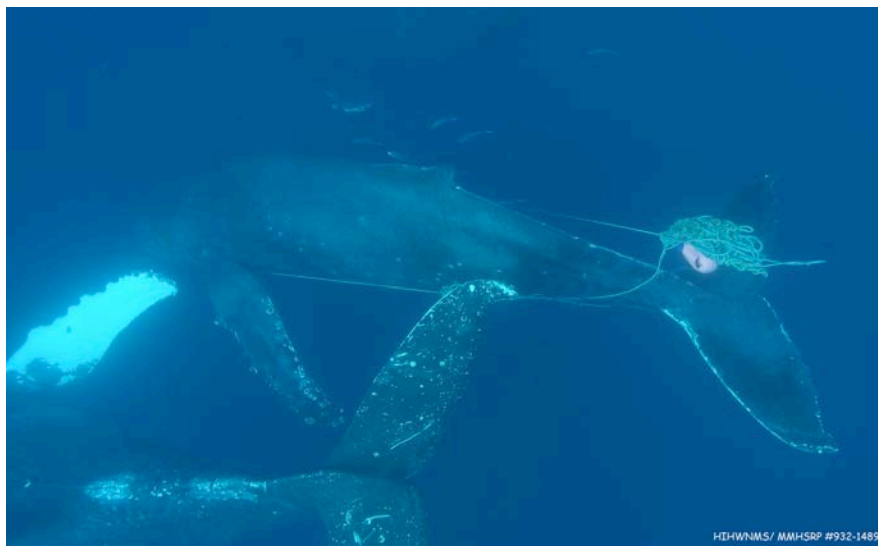
February 10, 2008, adult humpback entangled in heavy gauge line.

The fourth confirmed entanglement of the season was reported by the crew of the Prince Kuhio, a whale watch boat out of Maalaea Harbor, Maui, on February 10, off Maalaea and involved an adult female humpback that was the nuclear animal in a competitive group. The animal was entangled in heavy gauge line through the mouth and along both sides of body to a bundle of gear just above the animal's flukes. There was one wrap of line around the peduncle that held the bundle of gear close to the animal with a deflated red polyball attached.