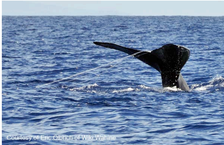
December 9, 2007, subadult humpback entangled in monofilament line.

The remaining 5 reports were confirmed as separate cases of humpbacks entangled in gear. The first confirmed report of an entangled humpback was received on December 9, 2007 from the tour boat, Wiki Wahine, off Lahaina, Maui. The subadult animal appeared healthy and was carrying an undetermined amount of monofilament line wrapped at least two times around tailstock and trailing at least 25 feet behind. The animal appeared recently entangled, with the line barely cutting in. Therefore, no response was mounted at the time.