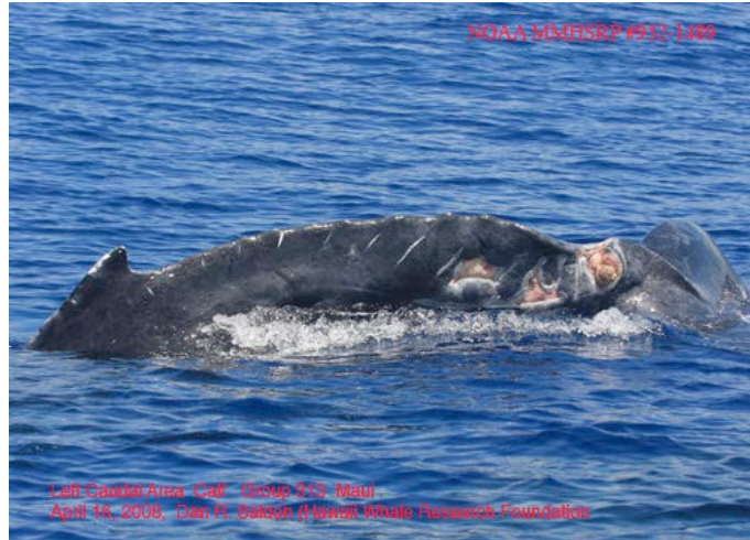
April 16, 2008 report of humpback calf struck by vessel.

Dolphin Institute, and Whale Trust, also played an important role in helping relocate entangled animals, and by documenting and assessing ship-struck animals. In many ways they and the tour boat operations made the difference in what really is a community-based response network.