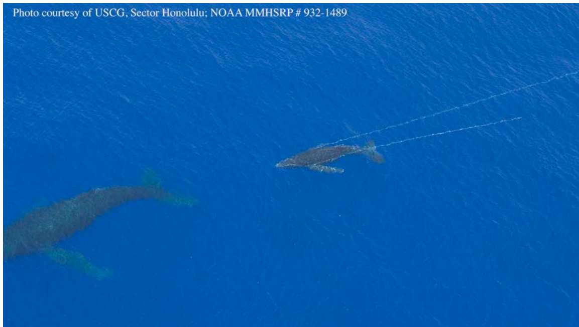
April 25, 2008, humpback calf trailing over 400 feet of line.