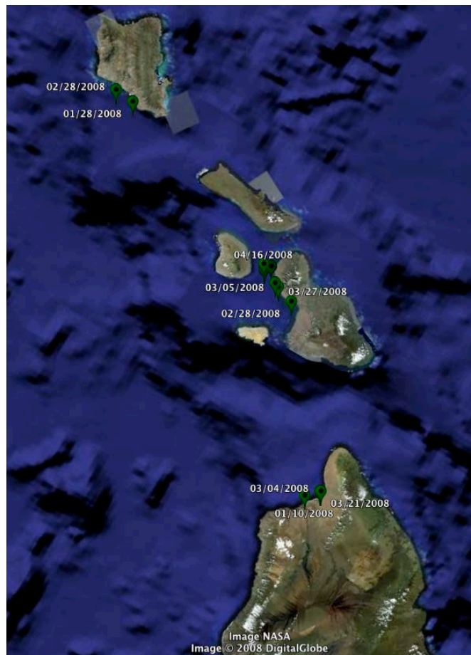
2007-2008 humpback season confirmed ship strike reports

In contrast to confirmed entanglement reports, the number of confirmed ship strike reports received by the Network was greater compared to past seasons. This season there were 12 humpbacks, involving 11 cases, reported as ship-strikes. Nine animals (in separate cases) were reported hit by vessels, and 3 animals (in 2 cases) were observed with wounds indicating a ship strike had recently occurred. Three of the animals were observed with minor injuries or the description of the event was such to indicate a minor strike. The island of Maui had the most reports at 7 animals (6 cases – 1 case was a mother/calf, both with wounds), followed by the Big Island with 3, and Oahu at 2. Kauai had no reports of ship strikes this past whale season. The breakdown by age class was 6 adults, 1 juvenile and 5 calves. In other words, half of the reports (50%) represented young animals. Past reports around the Hawaiian Islands indicate 83% of confirmed ship-strike reports involve younger animals (calves and juveniles). Six responses were mounted to document and assess reports of ship struck whales. Half of these were successful.