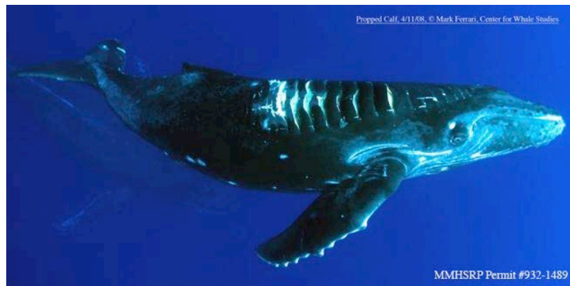
April 11, 2008 report of ship-struck calf.